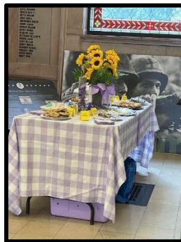
Reception on the Monument